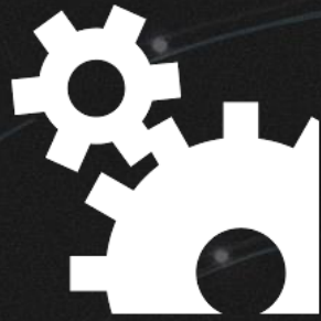
INPUT-OUTPUT DRIVEN INNOVATION