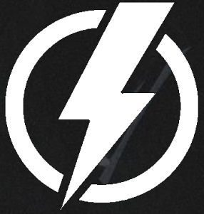
BIG & BOLD INNOVATION