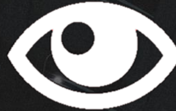
SCOUTING STARTUPS INNOVATION